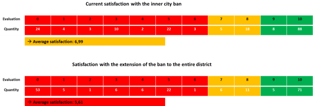
Figure 2: Citizen's satisfaction with inner city fireworks ban

This decline in satisfaction suggests that holistic prohibitions and the resulting loss of freedom lead to greater dissatisfaction. This underlines the fact that local bans in endangered areas are tolerated and desired by the population, but comprehensive bans are undesirable. This insight can be transferred to a national perspective, so that bans in endangered areas, as in the example of Stuttgart, which has already been taken up, certainly lead to greater satisfaction than nationwide bans. From a national perspective, therefore, other regulatory measures need to be considered, e.g., introducing emission limits for fine dust particles caused by fireworks. The results of the survey indicate that the fundamental problem of politics is to find a balance between benefits for the entire population and individual freedom.