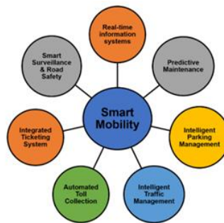
Figure 2. Key benefits of using smart mobility in a smart city

Sustainable mobility in cities entails the integration of technology and innovative approaches to enhance transportation and mobility systems within urban areas. The concept of smart mobility seeks to tackle prevalent urban challenges including traffic congestion, pollution, limited parking space, and inefficient public transportation systems. By embracing smart mobility solutions, cities can pave the way for a greener, more connected, and more efficient future of urban transportation. (Benevolo, C., Dameri, R. P., & D'auria, B., 2016). Smart mobility in cities aims to create a more connected, accessible, and sustainable transportation ecosystem by leveraging technology, data, and innovative solutions. It offers the potential to enhance the quality of life for urban residents, improve economic productivity, and reduce the environmental impact of transportation systems. (Mangiaracina, R., Perego, A., Salvadori, G., & Tumino, A. (2017). The key benefits of smart mobility in cities are presented in Fig. 2.