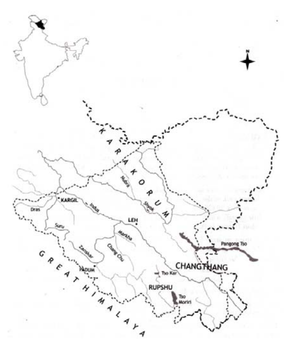
Figure 1. Ladakb (outlined) is located between the Great Himalaya and Karakorum ranges.