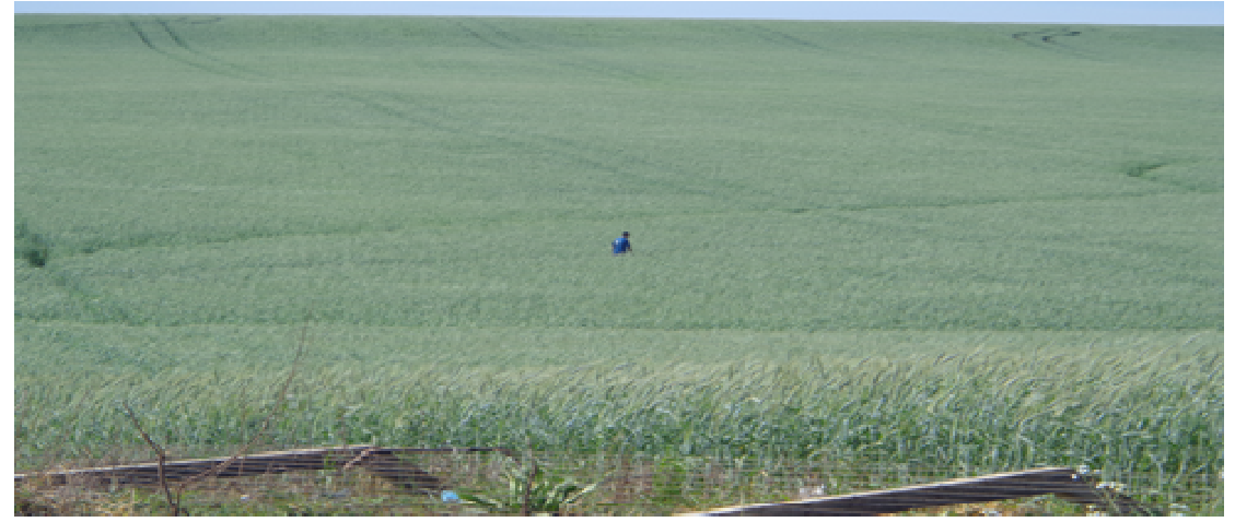
FIGURE 5: A resident of the neighborhood using one of the paths that crosses the crop area.

In general, in the communities, in the middle of the crop area, there are small rivers and paths that people use to get to other neighborhoods, or even in order to reach the school, the health center.