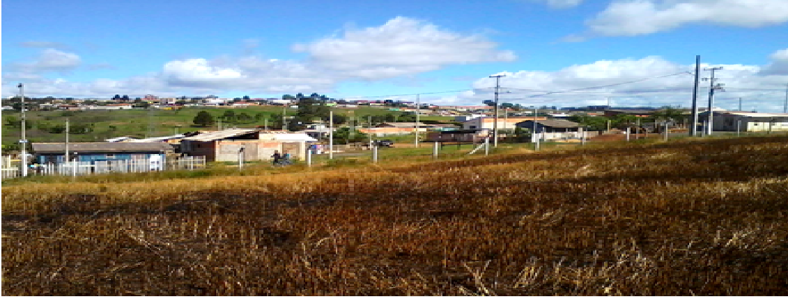
FIGURE 4: Area of burn clearing near the community