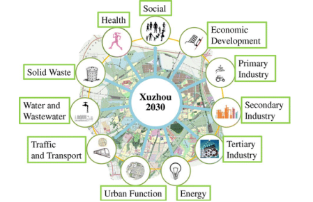
Fig. (4) Xuzhou eco-city 2030, China (Liu, Wennersten, Luo, Jiang, & Dong, 2016)

On the other hand, Xuzhou is another sample of the three eco-cities in China fig. (4). The transforming of this city was based on sustainable development of health, social, solid and waste water, traffic and transportation, energy, urban function, economic development, primary, secondary and tertiary industry. One obstacle faced this city, was that the frameworks have not been developed bottom-up in a local participation process. Xuzhou clarifies the importance of cooperation between the different city departments responsible for energy, water, and transportation (Liu, Wennersten, Luo, Jiang, & Dong, 2016).