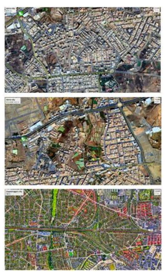
Fig. (8) Illustrates on the top & middle Al-Mansak & Al-Mwazafeen districts in Abha without green areas. Bottom Copenhagen, Denmark and the mixed-use developments (By researcher using Google Earth)