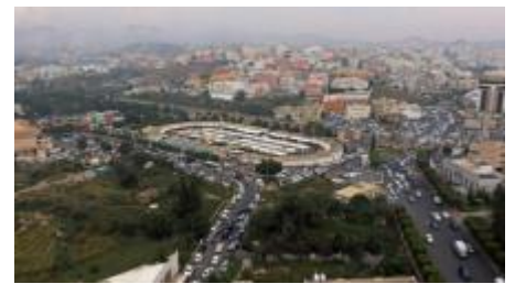
Fig. (6) Illustrates Abha streets, (feedyeti, 2018)