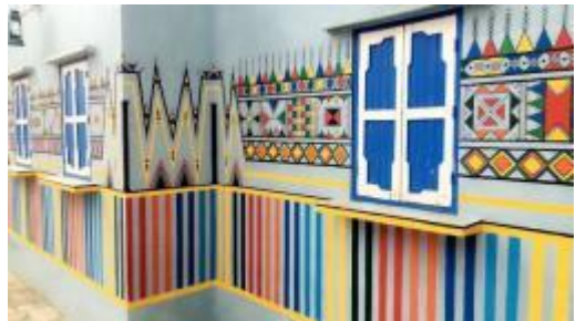
Fig. (11) Al-Got Al-Asiri, Asir (Al-Almaeiy, 2018)