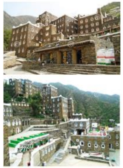
Fig. (10) Both top and bottom Rijal Almaa village architectural heritage, Asir (Reda, 2018)

(SCTA, 2010) fig (10) & (11). There is no sustainable development without respecting and searching for people heritage. It is obvious the beauty of buildings respecting mountain levels. Unfortunately, nowadays developers and contractors demolish the mountains and produce one level to can start construction. Asir arts like (El-Got El-Asiri) fig (11) which is accredited by Ionesco and produced by ladies in their homes in the past is not used anymore unless for exhibitions and forums.