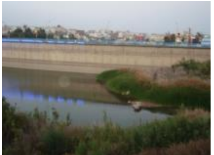
Fig. (7) Dam rainfall, Abha, (Titi, 2016)

Many projects of dam's construction took place in the territory of Asir. For example, dam rainfall in the city of Abha fig (7). Tens of dams has been constructed and planned more than this number in KSA vision 2030. All these projects give advantages to Abha city to be selected as eco-city.