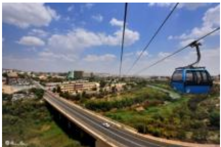
Fig. (2) Abha city, Saudi Arabia (Abir, 2015)

Abha is the biggest city in Asir territory Fig. (2). It has a big potential to be a sustainable city. Its weather, rainfall average and surrounding environment are motivations to select Abha as one of the best cities for living in the Middle East. It was selected as the capital of Arab tourism in 2017 (Abdallah, 2017). The summer is long, warm, arid, and partly cloudy and the winter is short, cool, dry, and mostly clear.