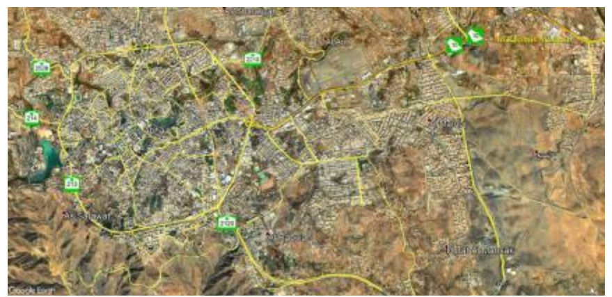
Fig. (5) Illustrates Abha city roads & streets. (By researcher using Google Earth)

The main mean of transportation in Abha city is the private cars. Unfortunately, there is no public transportation in Abha such as buses, tram, or trolley-bus. However, the planning of the city and the neighbouring city Khamis Mushait based on high-way and ring roads connecting most of the attraction points. Fig (5) & (6). This leads to two outcomes. First one, fuel consumption and carbon emissions now at the worst level compared to the population. Secondly, developing a sustainable public transportation plan using all possible means of sustainable transportation is much easier than any other city based on its planning and kingdom vision 2030.