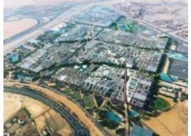
Fig. (1) Masdar city, UAE (Willmott, 2014)

First of all we should be more familiar and closer to the definition of sustainable cities and the difference between them against normal cities. Many cities such as Copenhagen, Amsterdam, Stockholm, Vancouver, London and more achieved the level of eco-cities. Those cities are enjoying living in high-quality of healthy life, less energy and water consumption, better land-use, and economic returns (Rigester, 2008). Most of Middle East cities are suffering from several environmental, economic, social, and land-use problems. The sample of Masdar city in UAE fig (1) as a sustainable city could be adequate for new urban development, but it is not convenient for an existing old cities which is the case of most of Middle East cities.