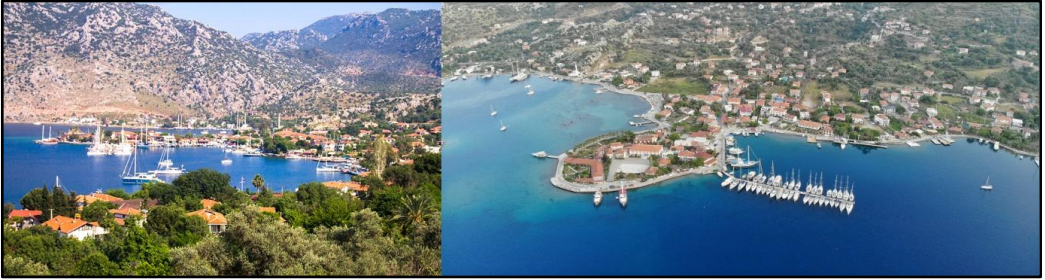
Photo 1. General views from Selimiye Village

(Source: https://kesfetsek.com/egenin-cennet-koselerinden-selimiye-marmaris/ ; www.locahotel.com/services/ )