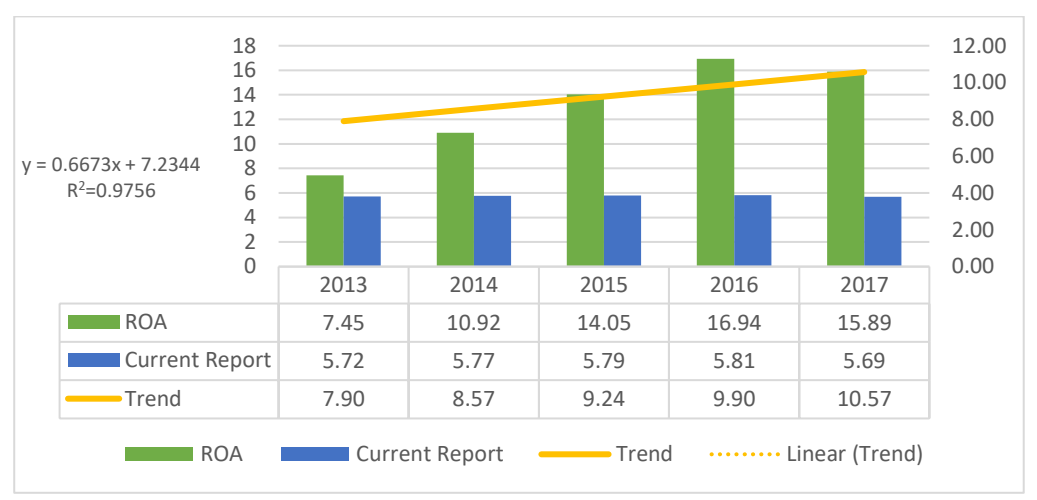
Figure 2. The linear trend between current ratio and return on assets for the commercial banks in Kosovo

Kosovo. Whereas, it is worth noting that in 2017, we have a modest decline in current ratio, from 5.81 to 5.69, which has also led to a decrease in return on assets. Based on this comparative analysis, we can conclude that the more liquid the commercial banks are, the greater their profitability. This also confirms the validity of the second alternative hypothesis, that there is a significant relationship between current ratio and return on assets.