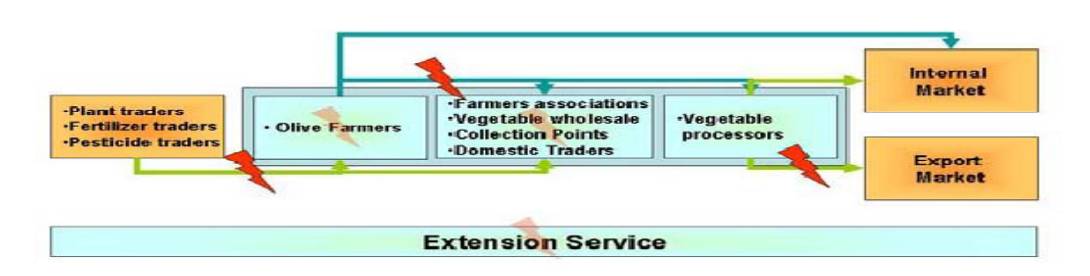
Scheme 2. Trade relations Olive value chain