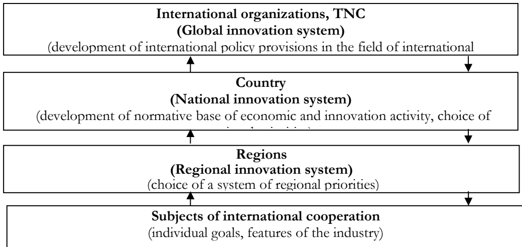
Fig. 1. Scheme of spheres of international cooperation in the innovation sphere.

Fig. 1 shows schematically the factorial groups that influence the processes of international cooperation.