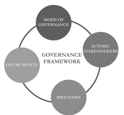
Figure 3: Governance framework The four components of the governance framework are explained below.