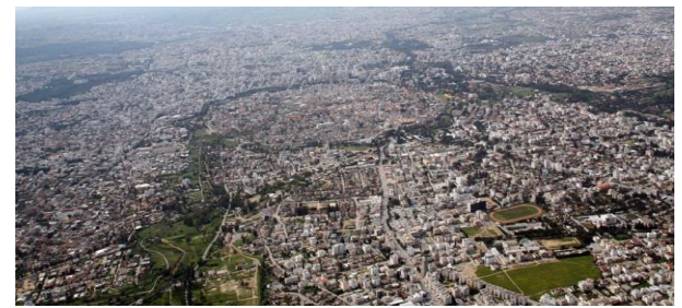
Figure 6: Bird's-eye view of Nicosia (T.R.N.C City Planning Department, 2018)