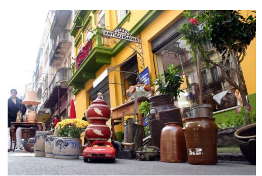
Figure 3: Antique Fair area (Caminho dos Antiquarios) in the city center, improved under the Viva o Centro program (Governo do Brasil, 2010)