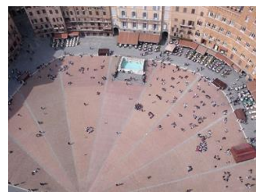
Figure 1: Historic Piazza del Campo Square (Project for Public Spaces, 2016)

Sustainability of historical environments depends on revitalization and renewal. In order to achieve integrated conservation, sustainability in historical environments and revitalization strategies should be implemented at the urban scale. For urban revitalization to be sustainable, physical revitalization should be implemented in the short term and economic and social revitalization should be implemented in the long term. The creation of sustainable environments in historical environments depends on the improvements in economic, physical and especially social life. Vehbi and Hoşkara (2009) have therefore created a model for sustainability in historical environments. In this model, three topics are considered for the sustainability of historical environments. These are sustainable physical revitalization, sustainable economic revitalization and sustainable social revitalization. See Figure 1 and 2 displaying Piazza del Campo Square in Siena, Italy as a historical urban environment.