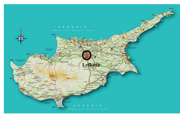
Figure 5: Map of Cyprus Island