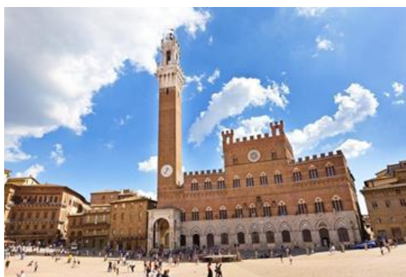
Figure 2: Piazza del Campo Square in Italy (Hürriyet, 2017)

Historical environments also have the ability to boost formation of urban identity. Identity can be defined as the separation of an object or an object from others in terms of individuality, specificity and technique. The identity of the city helps to differentiate and differentiate a city from other cities and it contains the original elements and qualities of the city (Lynch, 1960).