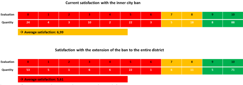
Figure 2: Citizen's satisfaction with inner city firework ban

This decline in satisfaction suggests that holistic prohibitions and the resulting loss of freedom lead to greater dissatisfaction. This underlines the fact that local bans in endangered areas are tolerated and desired by the population, but comprehensive bans are undesirable. This insight can be transferred to a national perspective, so that bans in endangered areas, as in the example of Stuttgart, which has already been taken up, certainly lead to greater satisfaction than nationwide bans. From a national perspective, therefore, other regulatory measures need to be considered, e.g., introducing emission limits for fine dust particles caused by fireworks. The results of the survey indicate that the fundamental problem of politics is to find a balance between benefits for the entire population and individual freedom.