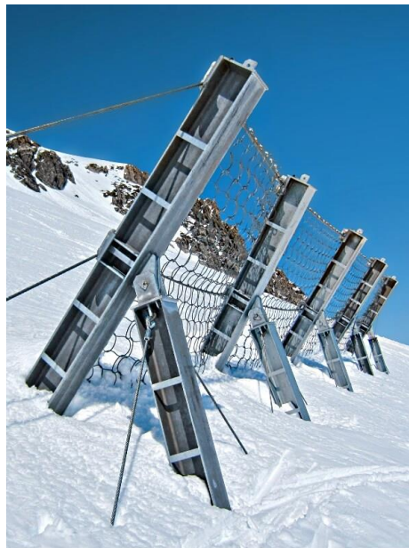
Figure 6. TRUMER snowcatcher ( https://trumerschutzbauten.com/avalanche-fences/ )

The means of defense, which have been tested and established in different sub-glacial mountainous regions of the world, must also be implemented in Georgia. The first defensive structures were the terraces erected in the 19th century. Currently, there are various technical methods for avalanche protection, utilizing materials such as steel, aluminum, wood, wire, and concrete. These measures can be categorized as structural, planning, forestry, and temporary, depending on their purpose. Both engineering and non-engineering safeguards are installed, depending on the intensity of avalanche activity in the region. Understanding the starting zone of the avalanche, its projected path, and the vulnerable objects in its trajectory is crucial for effective management and prevention of dangerous situations. Additionally, controlled explosions using snow rakes can be employed. Snow catchment fences and snow nets are also viable options for installation. (Figure 6) By adopting these proven means of defense, Georgia can improve its avalanche protection capabilities, ensuring the safety of its inhabitants and minimizing potential risks in these hazardous mountainous areas.