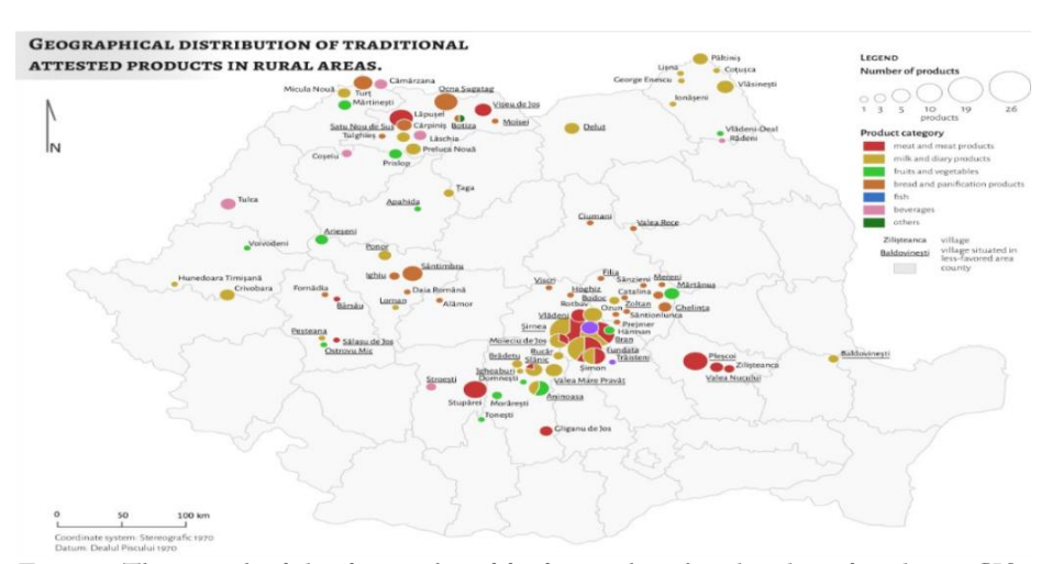
Figure 1. The geographical distribution of rural localities with confirmed traditional products - GIS map server achieved by processing database RNPT

The information used have been corroborated with the one related to scientific papers, historical, etnological, geographical, economic policies regarding the durable economic development of tourism. On their basis, we have identified relevant aspects that justify the orientation of actions towards the insertion of this form of rural tourism on the national and international tourist market.