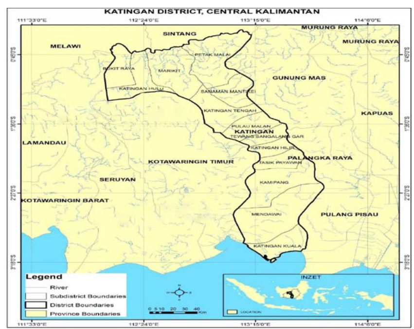
Figure 2. Map of study area

The Katingan river stretches approximately 650 km from the Muller-Schwaner mountains in the north of Kalimantan, Indonesia to the Java Sea in the south. Tumbang Runen village is located along the Katigan river, downstream of Katingan water catchment. The village covers an area of 11,400 ha of lowland with an average elevation above sea level less than 500 m. The area has a tropical humid climate with an annual average temperature of 31°C and receives a monthly rainfall ranging from 27.72 mm to 378.77 mm (Statistics of Katingan Regency, 2015). Tumbang Runen is one of the oldest villages in the Katingan Regency. This village was officially established in 1884, under Dutch Colonial rule.