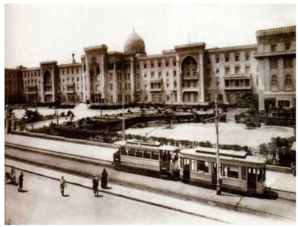
Fig.3 The Metro in front of Heliopolis Palace Hotel