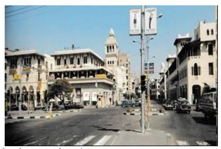
Fig. 7 Sshops, cafes and restaurants along main streets.

The presence of shops, cafes and restaurants along most main streets represent attractive points to most people and assures the transparency quality by their facades and proportion of active uses to the building. An interaction is taking place between the street space and the indoor space, leading to a perception of human activity beyond the street. The cafes and restaurants or the colonnades, arcades, street furniture, tables and seats all encourage outdoor dining as well which make a street a place to meet and stay, see fig. 7.