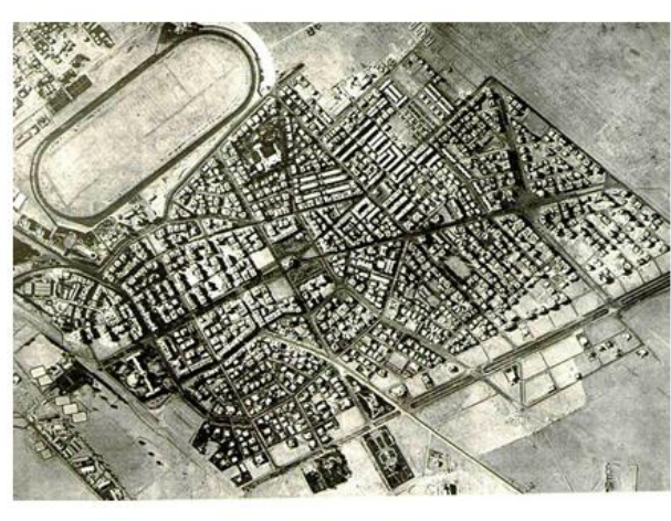
Fig. 1 left, The Heliopolis Company's Headquarters. Right, The Mass plan of Heliopolis in the year 1930.

Although much has changed in Heliopolis since first constructed, yet many of the constructed buildings are still exist, the same with the urban form of the city. According to its original plan, Heliopolis was to cover 2.500 hectares (Ilbert, 1981) including wide open green spaces and dwellings of all types, ranging from villas to very small workers dwellings. There was variety of buildings that attracted all the community's classes. Luxury buildings were constructed yet a special area of the new city was designated to house workers and servants (Osman, 2016). Their houses were economical but they were designed to provide good conditions for living.