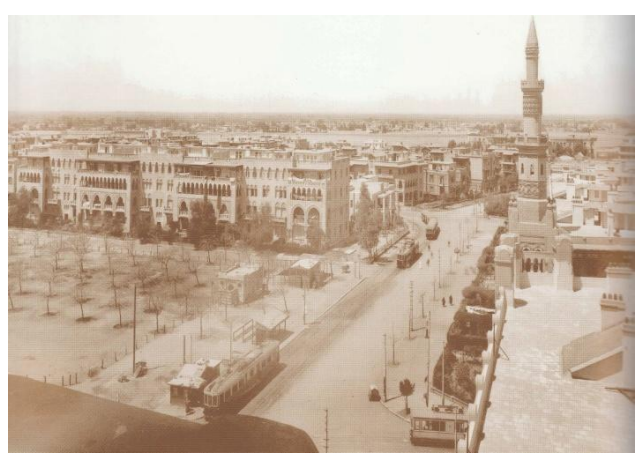
Fig. 2 The northern corner of the Basilica Square in the 1920s. This used to be dividing line between the luxurious section of Heliopolis to the left, and modest housing to the right.