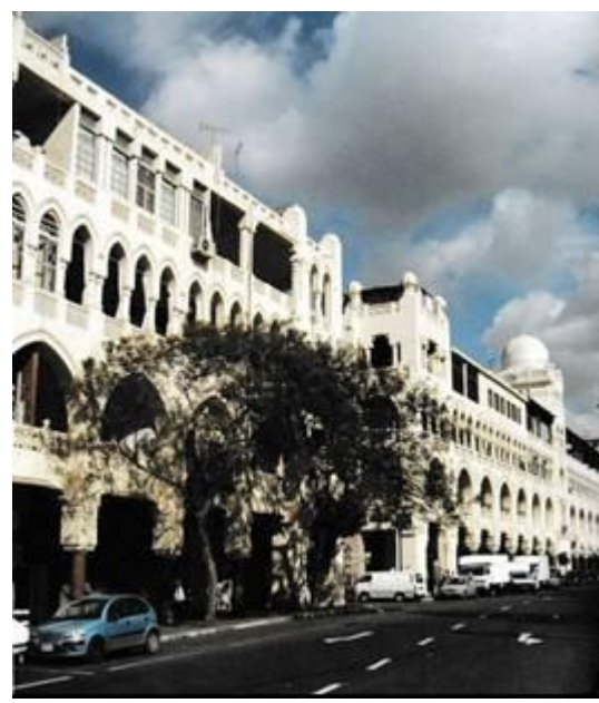
Fig. 6 The Distinctive wall of the street