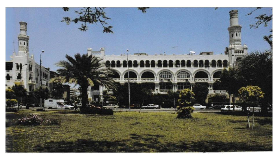
Fig. 5 The northern side of the Basilica square, where there is a significant greenery along the street space.

The human scale quality appeared through the significant physical features of the greenery along the street space, especially on sidewalks between the path for pedestrians and the driveway for vehicles, see fig. 5. All street furniture and other street items strengths this quality and they are not interfering with pedestrians' movement, such as shaded benches and lighting columns. The flower boxes and small planters have a role towards the human scale in the street space, where they are located along the path.