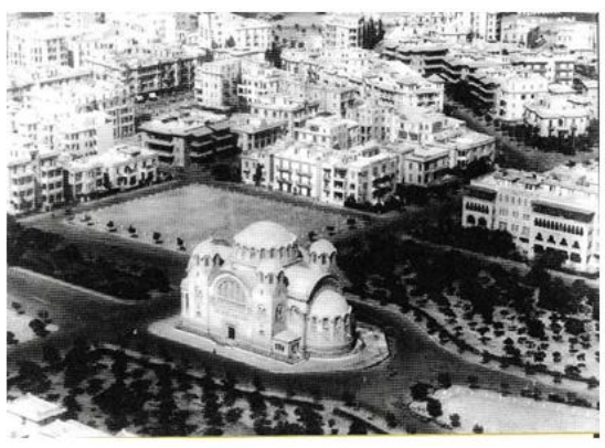
Fig. 4 The Notre Dame Basilica built in the year 1911, opposite, an aerial view of the Basilica in the 1940s.

The human scale quality appeared through the significant physical features of the greenery along the street space, especially on sidewalks between the path for pedestrians and the driveway for vehicles, see fig. 5. All street furniture and other street items strengths this quality and they are not interfering with pedestrians' movement, such as shaded benches and lighting columns. The flower boxes and small planters have a role towards the human scale in the street space, where they are located along the path.