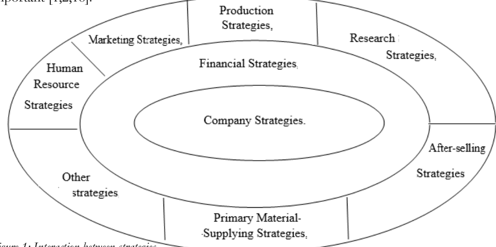
Figure 1: Interaction between strategies

At this point the administrators identify opportunities, barriers, pros and cons in the implementation of their strategy [18]. In view of the discussions about the formation of financial strategy and its role in integrating organizational goals together, it seems financial strategy is the most central l strategy that is considered by corporate executives ahead. The communication of this strategy with other organizational strategies is very important [1,2,18].