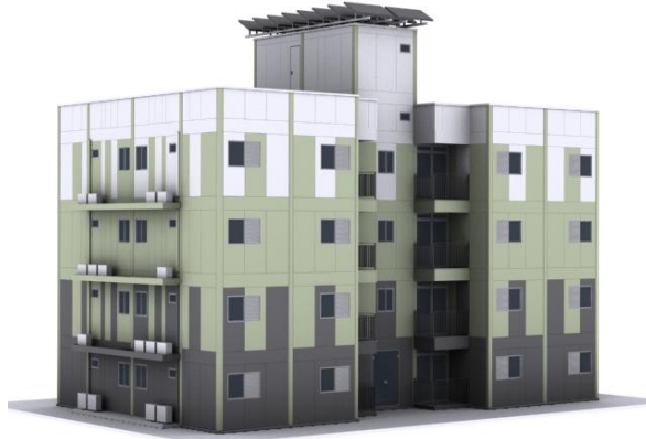
Fig. 2. Digital model of the multi-family building showing the solar panels oriented to north.