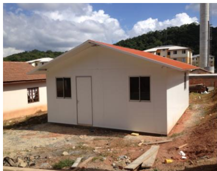
Fig. 1. A view of the house.

Taborianski (2002) showed that the most common single-family house in Brazil is composed of five rooms (one bathroom), with four inhabitants per house. For this study, a house similar to that used by Taborianski (2002) was used. Fig. 1 shows a view of the house. Its floor plan area is 37.06 m 2 (6.68m x 5.90m) with two bedrooms, a living room/kitchen, and a bathroom. Its indoor height measures 2.50m and the overall height is 3.73m. A four-storey multi-family building with similar room distribution was also analysed. Fig. 2 shows a view of the digital model of the multi-family building. It is possible to see the solar panels on the roof.