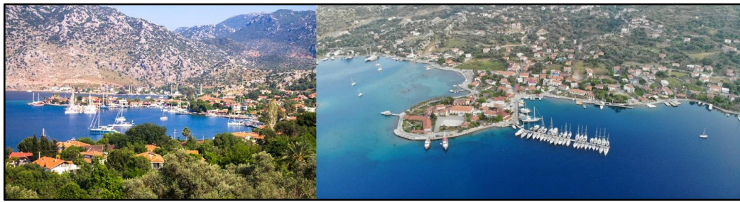
Photo 1. General views from Selimiye Village

When the previous studies on Selimiye Village are reviewed, it is seen that the village was briefly mentioned in the works by Yazıcı (2007), Oruç (2010), Yılmaz (2010), Taşlıgil (2008) mainly focusing on the Datça-Bozburun Special Environmental Protection Area. The only study conducted to determine the effect of tourism activities in Selimiye Village on spatial elements and architecture is by Yörür et al. (2018).