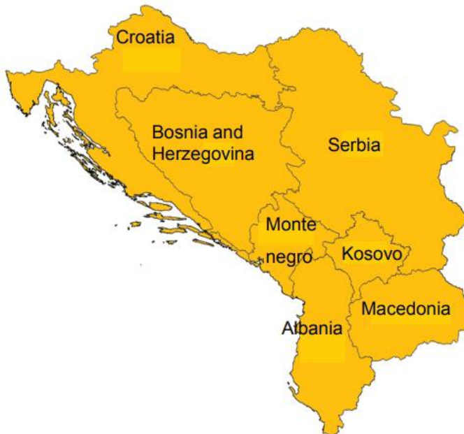
Figure 1. Map of the Western Balkans Countries

The recently signed Memorandum of Understanding of the WB6 on regional electricity market development ("MoU") constitutes the basis for further regional market integration; it is a positive signal in the right direction. A central element is now how to continue national reform and regional market integration efforts, and to allow integration of the SEE markets into the pan-European electricity market.