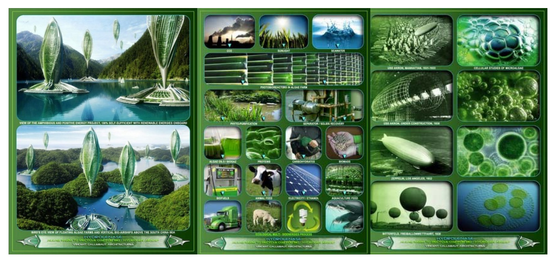
Figure (1): floating Algae farm inspired from the shape of seaweeds found in ocean that recycle the co2 for the biohydrogen flying airship