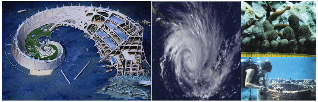
Figure (4): The city takes the form of the swirling of the sea, showing how to such co2 and make it as building material; Source: http://www.globalcoral.org/Ocean-Grown%20Homes.htm

2.4. Self –Assembling City from the Sea-Autopia Ampere (Eco-Island City)