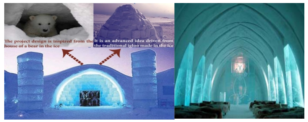
Figure (5): The Ice Hotel Sweden

The Ice Hotel Sweden, first constructed in the late 1980's, is built and re-built each winter in Jukkasjarvi, located about 120 miles north of the Artic Circle. Each year, the ice hotel has a different design, usually spreading over a space of about 53,700 feet. The Sweden Ice Hotel is open for business beginning in December (depending on the weather) and ending in March.