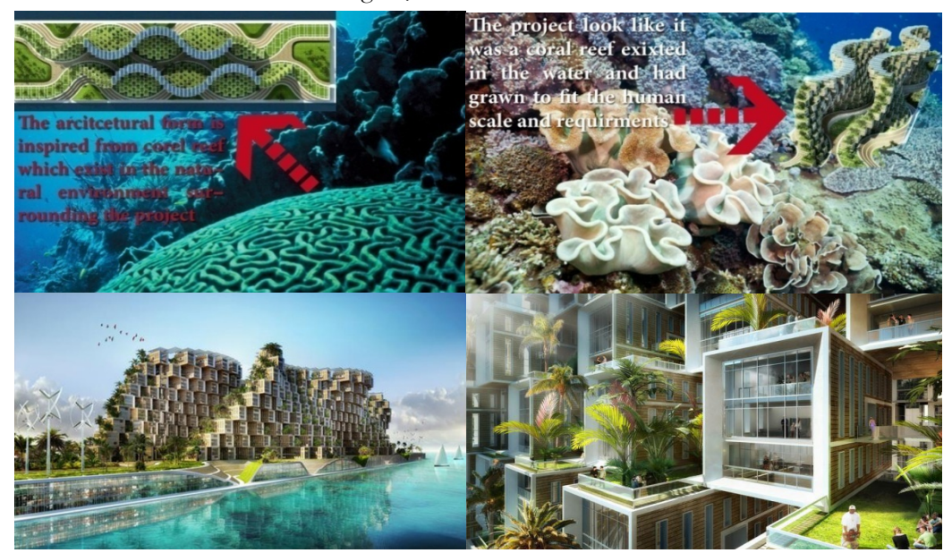
Figure (2): The architectural form is inspired from Corel reefs which exist in the place.

(a) The Beauty and The Shape Of The Nature: