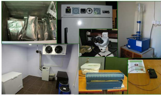
Figure 5: National Seed Bank facility and equipment.