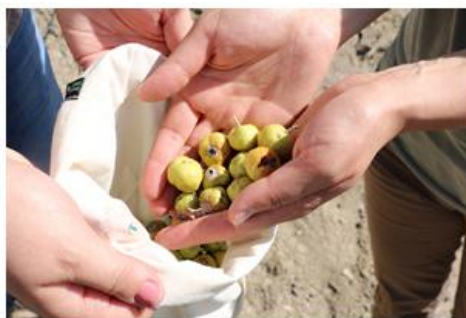
Figures 2, 3: NSB team members assessing the population of target species - Eversmannia subspinosa (DC.) B.Fedtsch. in Vashlovani Nature Reserve, Eastern Georgia (left). Collection process of Caucasian endemic pear species Pyrus takhtadzhianii Fed. in Eastern Georgia (right).