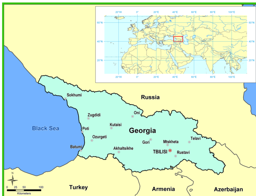
Figure 1: The Republic of Georgia on the world map.

The Caucasus, and Georgia in particular, has been attributed to the world's biodiversity hotspots.