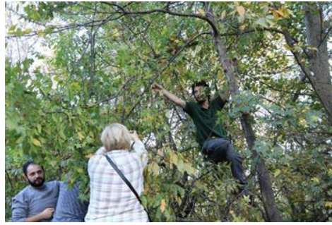
Figure 4: Seed collecting process of Acer laetum C.A.Mey. at Gombori pass in Eastern Georgia