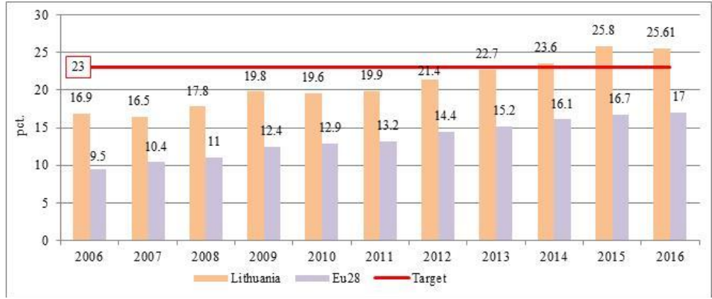
Fig.1. Energy production using renewable energy resources, %

Lithuania's National Energy Strategy has a legally binding target, in the year 2020, the share of renewable energy would account for at least 23% of the total final energy consumption of the country, and the share of renewable energy would account for at least 10% of final energy consumption in the transport sector (ECC 2017). It can be noted that in 2014, 23% of the total number of people in the EU was reached (Figure 1).